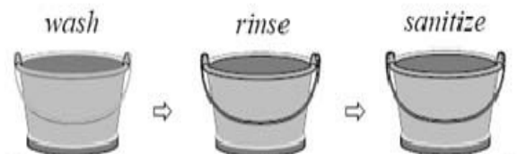
A. Water and Soap B. Clean Water C. Water and Sanitizer