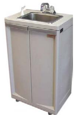
A. Pressurized Hand Washing Sink (Required for events >10 days/year)